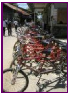
Bicycle for Rent

A trip to Pulau Ubin begins with a bumboat ride from Changi jetty at Changi Village. Do spend some time walking around Changi Village. Enjoy a meal at the Changi Village hawker centre where you can find one of the most popular nasi lemak stalls in Singapore. Changi Village has a laid-back village atmosphere, especially at night when the coffee shops are buzzing with people and most open till the wee hours of the morning.