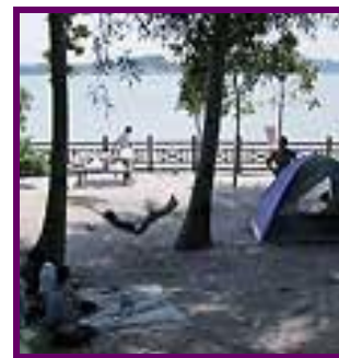
Beaches in P. Ubin